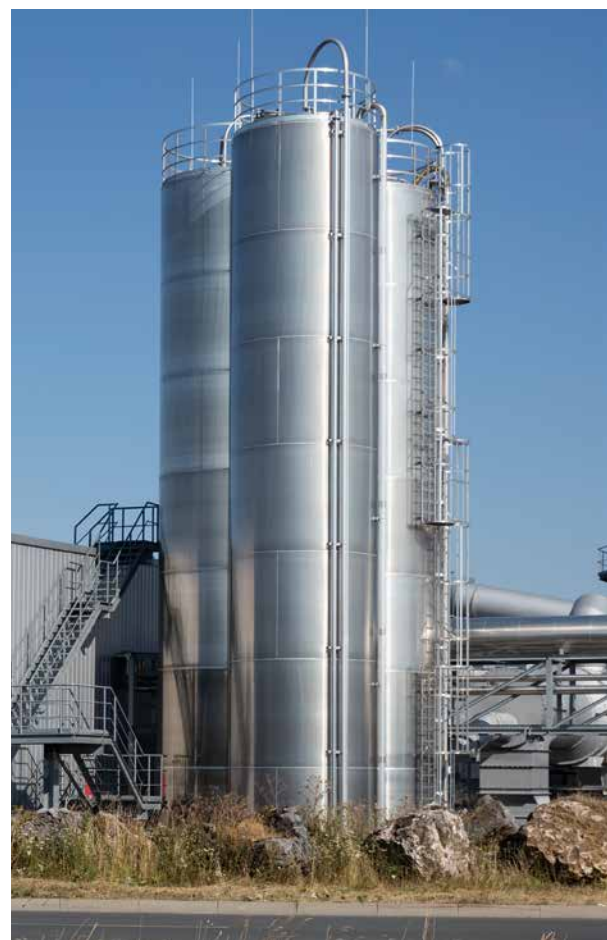
Raw material silos

Through the integration of edging production in the Brilon plant , existing infrastructure and logistics concepts are utilised. This makes it easy and comfortable to supply edging to the furniture industry.