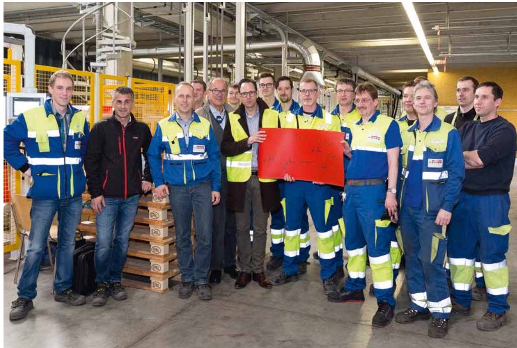
Production approval of the first EGGGER PP safety edge